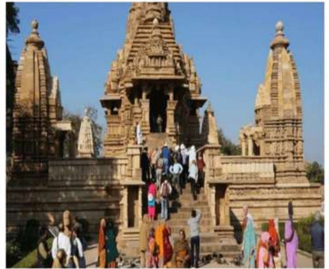
UNESCO WORLD HERITAGE KHAJURAHO TEMPLE, CHHATARPUR, M.P.