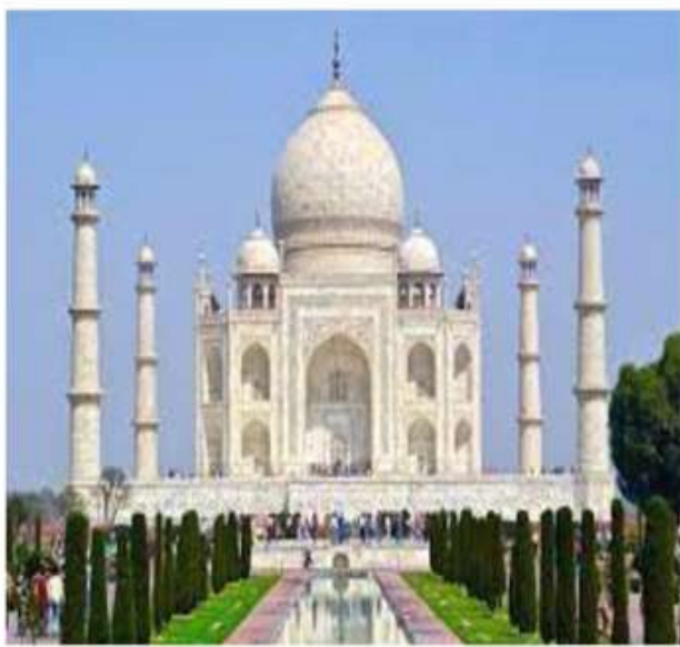
TAJ MAHAL, AGRA, UTTAR PRADESH (UNESCO WORLD HERITAGE CENTRE)